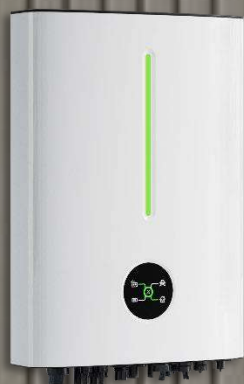
Single Phase HP1 3~6kW