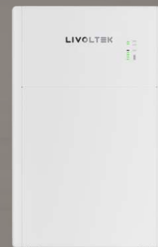
iPower (AC Couple) AES 3K~5K (all in one )