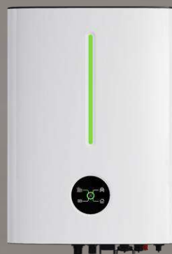
Single Phase Retro 3~6kW