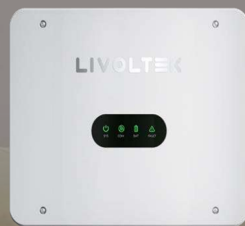
Three Phase HP3-5~12kW-D2