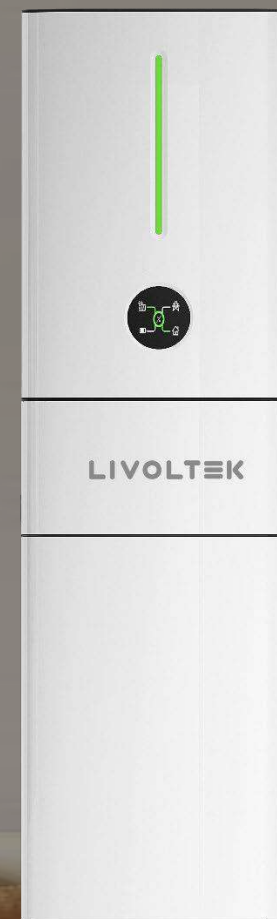
iPower (all in one) HES 3~6kW