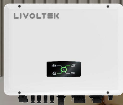
Three Phase HP3-5~30kW-D1