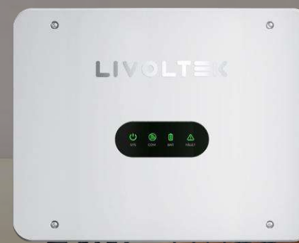
Three Phase HP3-15~30kW-D2